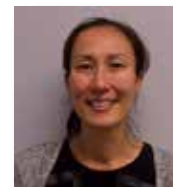
Mrs Ellis Sixth Form Teaching Assistant

Weatherhead Sixth Form is a community of over 360 students studying a combination of over 31 courses, both academic and vocational. The Sixth Form Team looks forward to assisting you with your course choices and welcoming you into Sixth Form in September 2022.