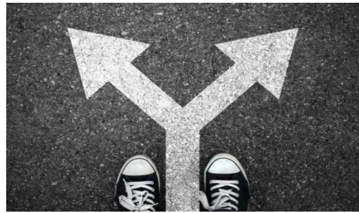
BESPOKE SUPPORT SESSIONS