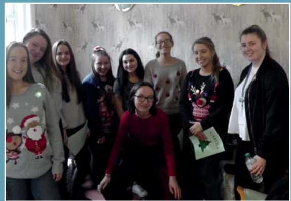
Students visit the Devonshire Centre