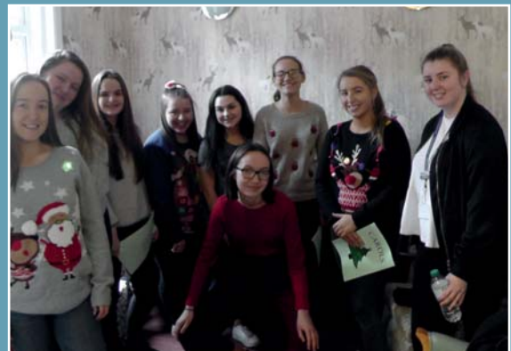
Students visit the Devonshire Centre